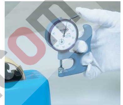
SM-112AT Contact point and Anvil have special coating for free from adherence. Suitable for measurement of adhesive tapes etc.