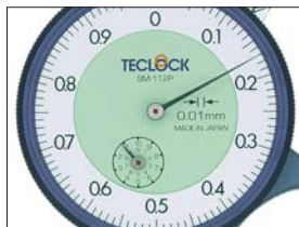
1.17mm reading example