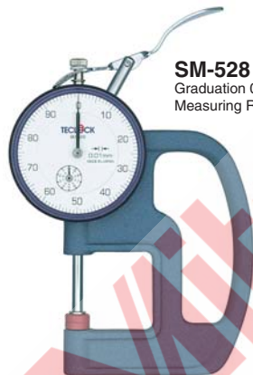
SM-528 Graduation 0.01mm Measuring Range 20mm