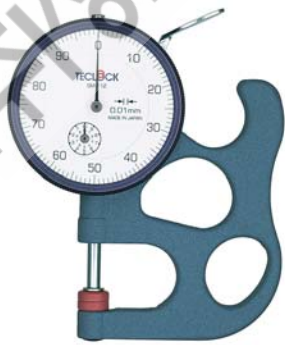
SM-112 Graduation 0.01mm Measuring Range 10mm