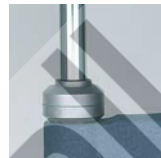
FE type φ10 Flat (steel)