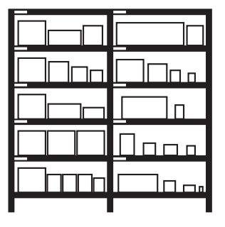
For counting product inventories per each category or size in warehouses