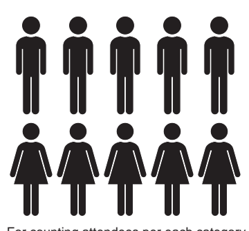
For counting attendees per each category (e.g. age and gender) at various events

For counting defective items per each cause during inspection process